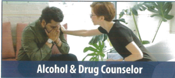
Alcohol & Drug Counselor