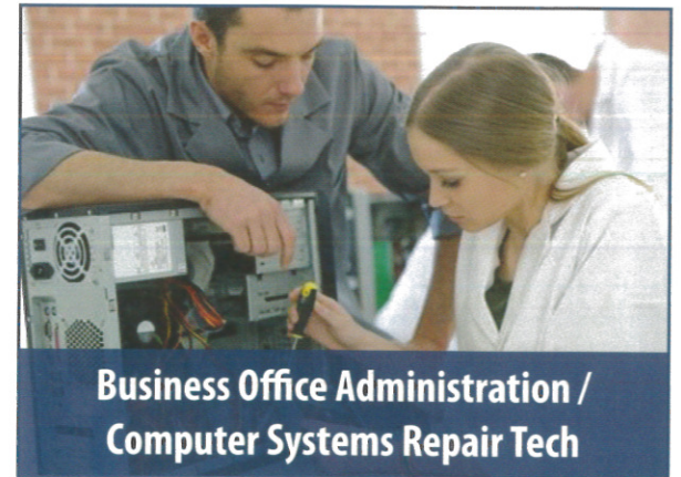
Business Office Administration / Computer Systems Repair Tech