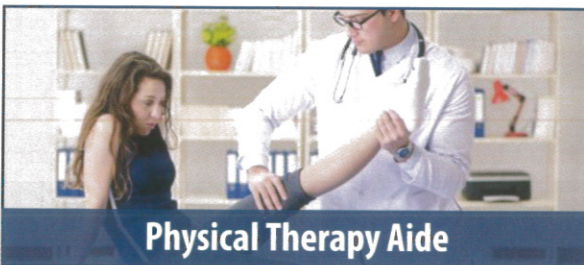
Physical Therapy Aide